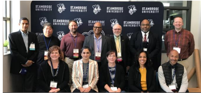
2021 MAM Board of Directors